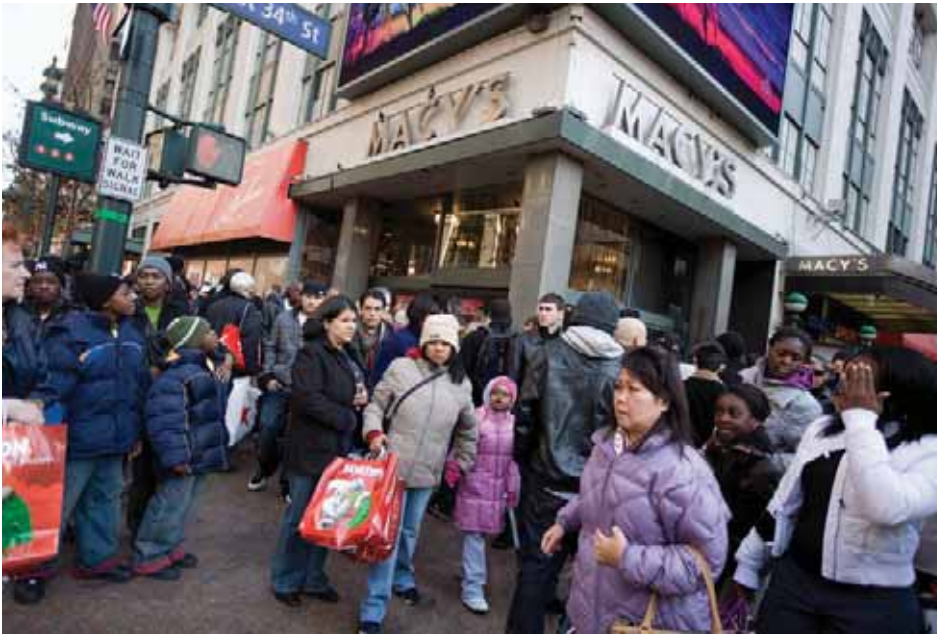
FIGURE 13-2 CBD retailer with high threshold. Shoppers flock to Macy's in Midtown Manhattan the day after Thanksgiving.

who work in the center and shop during lunch or working hours. These businesses sell office supplies, computers, and clothing, or offer shoe repair, rapid photocopying, dry cleaning, and so on. In contrast to the other two types of retailers, shops that appeal to nearby office workers are expanding in the CBD, in part because the number of downtown office workers has increased and in part because downtown offices require more services.