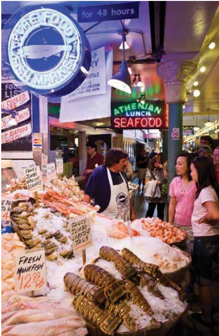
FIGURE 13-3 CBD retailer with high range. Pike Place Market in downtown Seattle sells food at individually owned stalls.

larger CBDs. And cities such as Minneapolis, Montreal, and Toronto have built extensive pedestrian passages and shops beneath the center. These underground areas segregate pedestrians from motor vehicles and shield them from harsh winter weather.